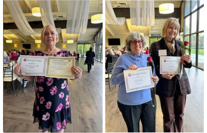
Outstanding Chapter Members: