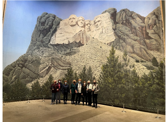
Academy of Motion Pictures Museum

Lunch and tour of Leonis Adobe Museum in Calabasas has been cancelled. There will be a bring your own lunch/chair to the park day instead. Details to follow.