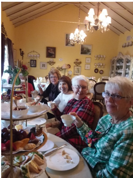
Montrose T room

DKG CA Convention in Burbank! April 29 th to May 1 st . This will be held at the Los Angeles Marriott Hotel located at Burbank Airport, 2500 N. Hollywood Way. Beta Epsilon is the 'Welcoming Committee' for this huge event. Please plan to help out with hospitality details, as well as attending this wonderful convention. More details/sign ups to follow as we learn more about our duties.